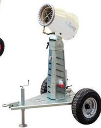
Light Duty FogCannon - Trolley mount