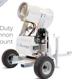
Heavy Duty FogCannon - Trolley mount