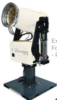
Extreme Duty FogCannon - Pole mount