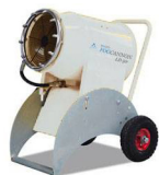
Light Duty FogCannon - Portable

The FogCannon products control dust at the source by emitting extreme air velocity with large volumes of fine water droplets that physically capture and push dust to the ground, completely suppressing it from the air in virtually any site and under virtually any condition. The product range includes pole mount, base mount or trolley mount units. All sizes comes with a fan motor, high pressure fog pump, fog misting nozzle and optional automatic oscillation / tilting feature. Custom Duty FogCannon (available upon request) built within a self contained trailer unit which also include a generator and water tank.