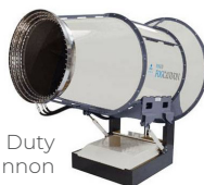
Extreme Duty FogCannon - Base mount