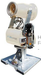
Heavy Duty FogCannon - Pole / Base